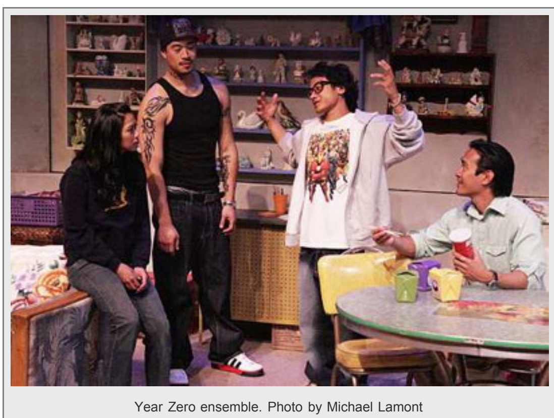
Year Zero ensemble.

JUN - 13 | NO COMMENTS | RELATED : REVIEW, THEATER